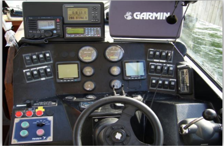
Picture frome drivers view on a Swedish Coastguard vessel.

Telium Pandoras flexible platform and ease of use are a perfect combination to offer systems in different sizes and customized for each user's specific communication needs.